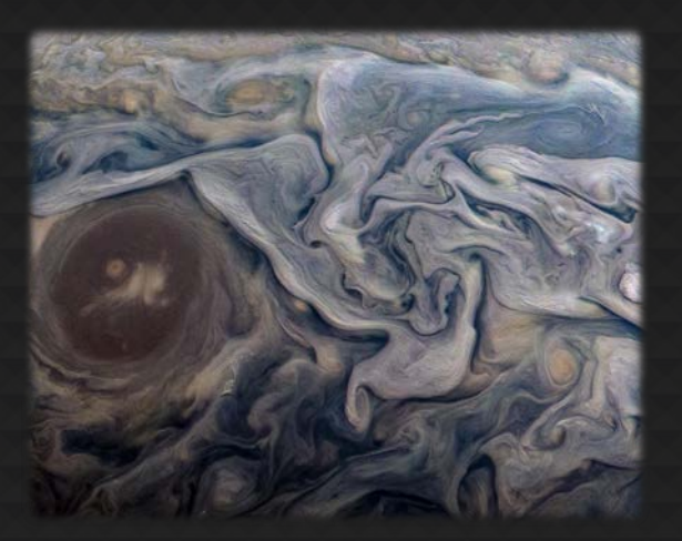
Feb 12, 2019 – Jet stream region called "Jet N6"