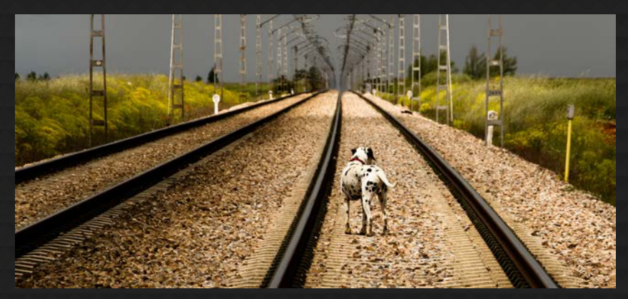
Lejos de Yulín